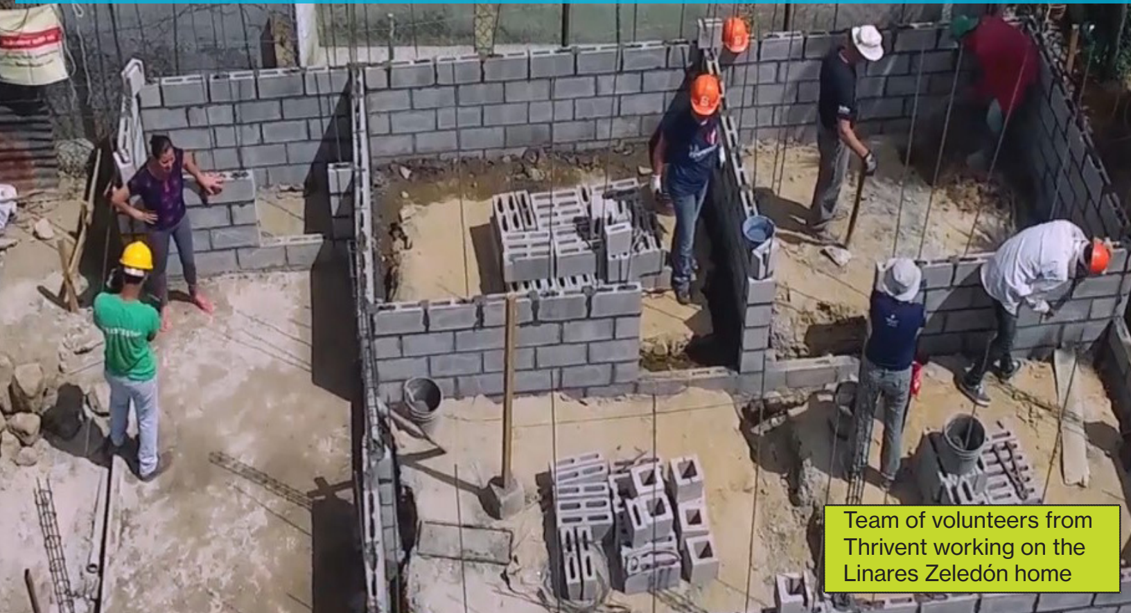
Team of volunteers from Thrivent working on the Linares Zeledón home